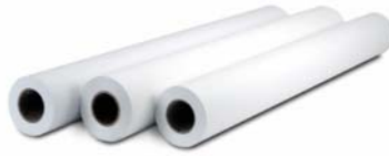
HP Universal Satin Photo Paper