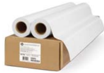
HP Everyday Adhesive Matte Polypropylene, 2 Pack