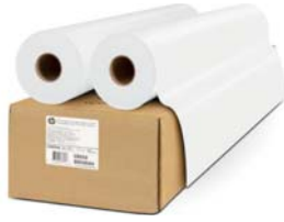
HP Everyday Matte Polypropylene, 2 Pack