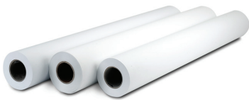
HP Premium Instant-dry Satin Photo Paper