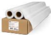
HP Premium Matte Polypropylene, 2 Pack